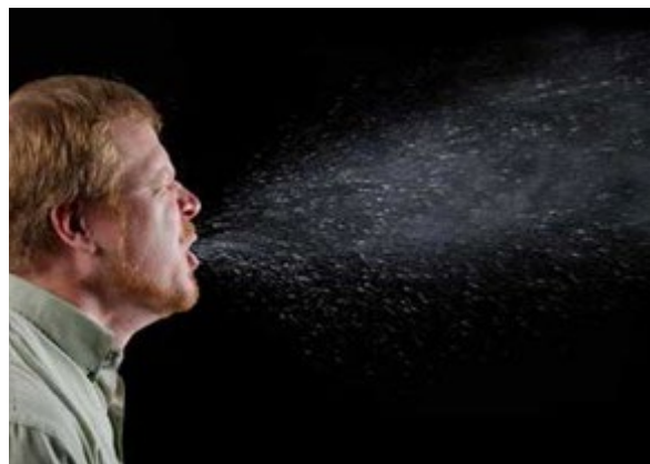
Airborne droplets visible during sneezing (photo enhanced).

Healthcare personnel who care for patients with ATDs must work in close proximity to the source of the hazard; even with controls in place, they are likely to have a higher risk of inhaling infectious aerosols (droplets and particles) than the general public. These personnel, and others with a higher risk of exposure related to the tasks they perform (e.g., lab or autopsy workers), must often be protected further through the proper use of